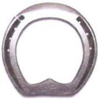
Set down bar Steel 25/10 Nail E5 Holes 7 Width 160mm Length 165mm