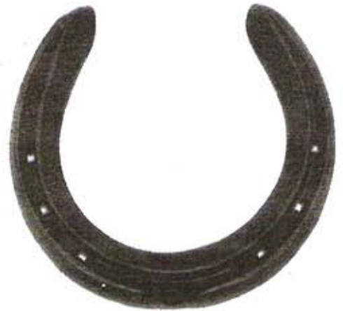
Tool and Fullered Steel 16mm square Nail E5 Holes 6 Toe clip Bottom tool aloud