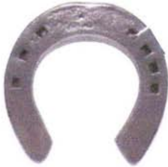
Welsh Cob front Steel 345mm 25/12 Nail E7 Holes 7 Width 140mm Length 145mm Massalot clip