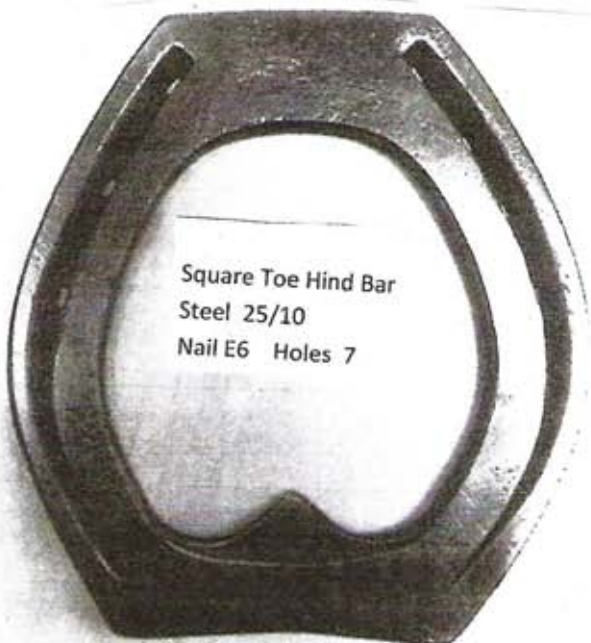
Square Toe Hind Bar Steel 25/10 Nail E6 Holes 7