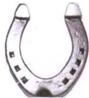
Double calkin Carriage Hind Steel 355mm of 32/12 Nail E8 Holes 7 Width 135mm Length 160mm Bob punch clip