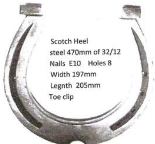
Scotch Heel steel 470mm of 32/12 Nails E10 Holes 8 Width 197mm Legnth 205mm Toe clip