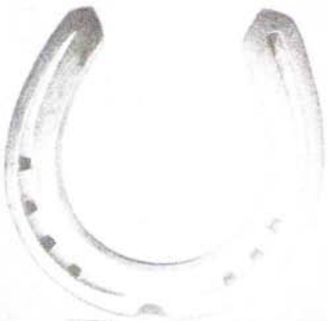
Lateral Extension front Steel 375mm of 25/10 Nail E6 Holes 7 Width 157mm Length 165mm Hammer drawn clip

SEED FORGEING Pair of Concave shoes As per specimens fronts or hinds TIME 15 min